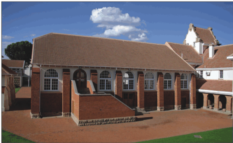
Die Reüniesaal is die Reünie se grootste geskenk aan die skool.