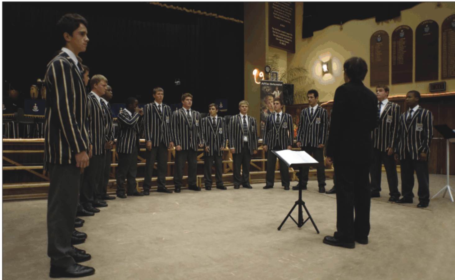
Die Indomitus-sanggroep het, soos gewoonlik, 'n optrede van hoogstaande gehalte gelewer.